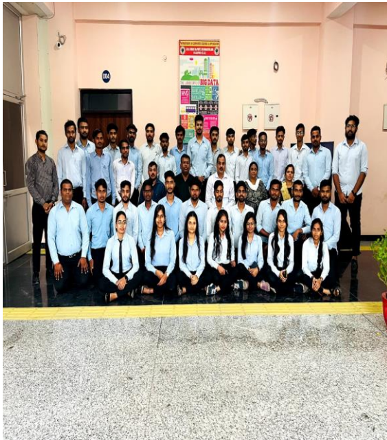
Group Photograph Session of MSc Final Year Student