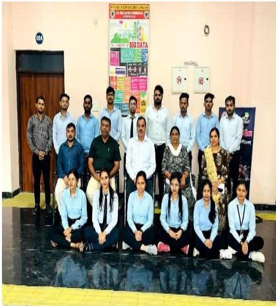
Group Photograph Session of MSc Final Year Student