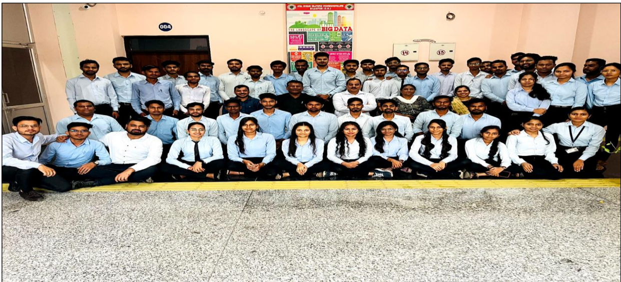
Group Photograph Session of MCA & M.Sc. Final Year Student